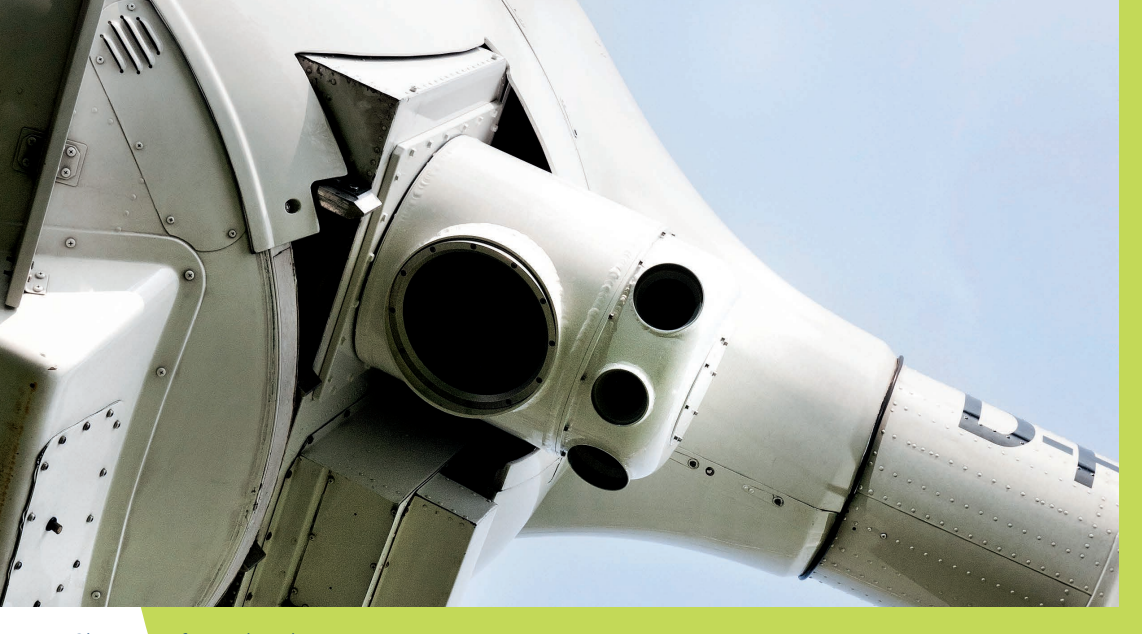
Close-up of scan head